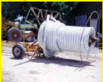
top end of the spool and then backs up and inserts the upright shaft through a 12-in. dia. pipe in the roll. In the field, a pair of hydraulic cylinders are used to tip

This home-built 2-wheeled trailer is designed to hold a roll of drainage tile vertically for transport and then tip it back in the field to unroll into a trench. To load a roll, the operator removes a reel from the