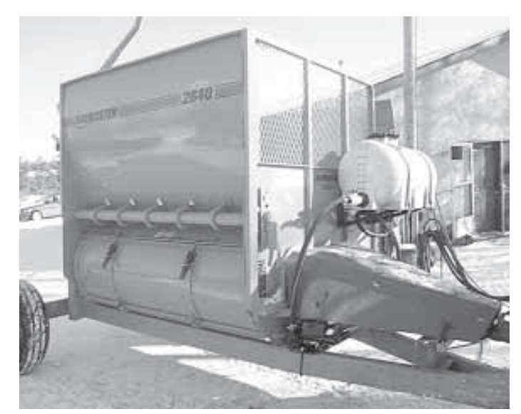
Molmixer sprays molasses liquid supplement onto shredded material as it's ejected.