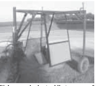
Rig's rear wheels straddle two rows of corn. A box suspended between the rows opens at the bottom for easy unloading.

When it comes time to pick the sweet corn, Lubben turns over the driver's seat to a grandchild, while he walks behind the box