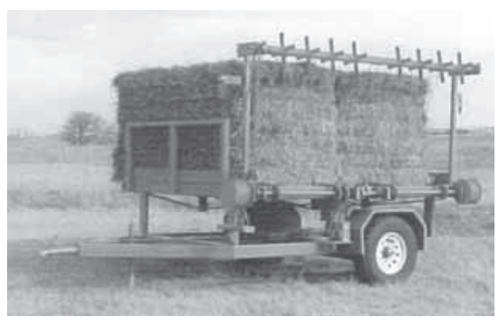
Bale flaker is designed to be pulled by any 1-ton pickup or a tractor and can feed either