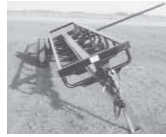
To unload, you pull a lever and trailer pivots to the side.

T&B equips the trailer with 16-in. wheels on which are mounted your choice of 10 or 14-ply tires. Each of the tandem axles is rated at 6,000 lbs., giving it a 12,000-lb. load rating.