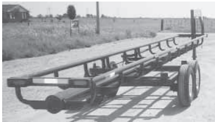
Tandem axle trailer can haul five to eight big round bales at a time.