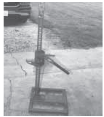
Bolt-on big base makes jack safer to use.

Brandenburger, Rt. 2, Beecher City, Ill. 62414 (ph 618 487-5247).