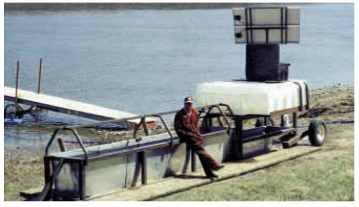
"It can be moved from pasture to pasture and delivers a clean supply of water at all times," says David Quick about his new portable solar-powered waterer.

Contact: FARM SHOW Followup, Case IH, 700 State Street, Racine, Wis. 53404 (ph 414 636-5678; Website: www.caseih.com).