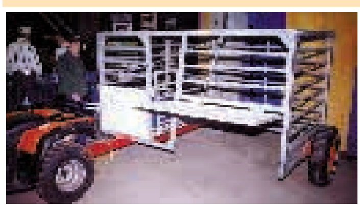
Two-wheeled steel cage has a 4-ft. wide, 2-ft. high metal door on one side that's hinged at top. Driver chases after calf with door open to a horizontal position.