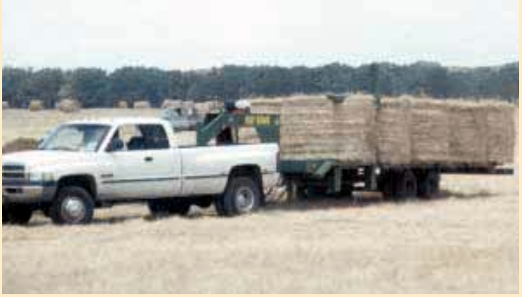
"Hay Hawg" is fitted with its own power unit which provides hydraulics and electronic controls. Rig will pick up and transport 10 round bales behind a 3/4-ton pickup.