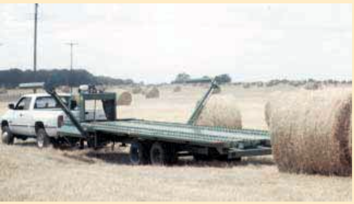
Lift arms on either side of trailer load bales onto deck where chains move them backward.

Contact: FARM SHOW Followup, Scott Manufacturing, Inc., P.O. Box 10232, Lubbock, Texas 79408 (ph 806 747-3395).