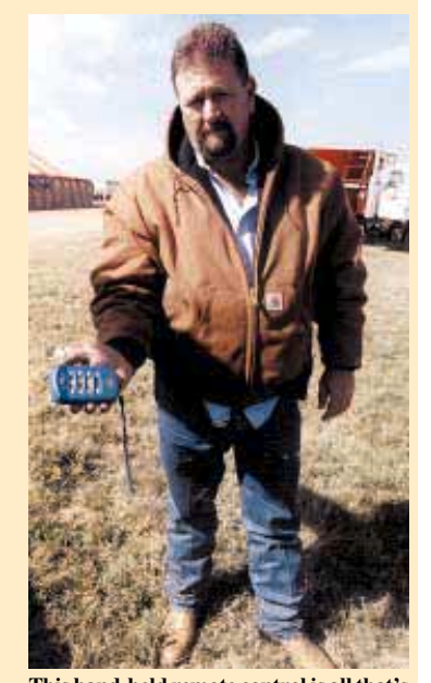
This hand-held remote control is all that's needed to run the Hay Hawg.

Cheatham decided to use a remote control because he didn't like the thought of running