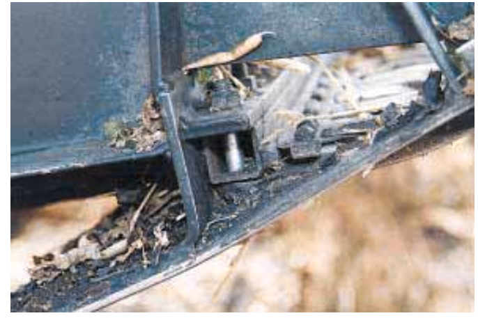
Siemens lowered the swather cutterbar 1 1/4 in. using a piece of square tubing that bolts to the bottom of platform.

Contact: FARM SHOW Followup, Don Moss, Rt. 1, Box 27, Tallula, Ill. 62688 (ph 217 634-4158).