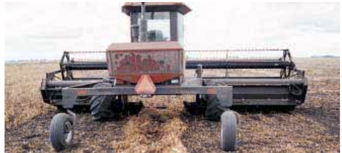
"We can run the knife in the dirt if we need to when cutting beans," says Siemens.

Contact: FARM SHOW Followup, Jack Siemens, Box 42, Plum Coulee, Manitoba R0G 1R0 Canada (ph 204 829 3995).