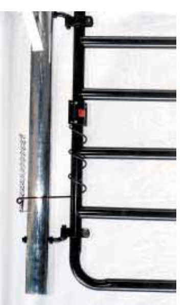
"Gate Shut" consists of a single spiral spring that slips onto hinged side of a gate. A catch arm at top of spring rests against gate post.

Contact: FARM SHOW Followup, Lyle Abernathy, Box 197, Yacolt, Wash. 98675 (ph toll-free 866 868-3267 or 360 686-8141; fax 360 686-8203; E-mail: gateshut@pacifier.com).