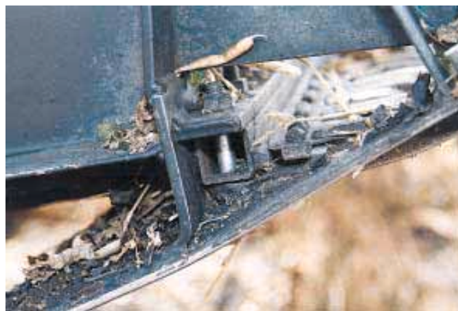
Siemens lowered the swather cutterbar 1 1/4 in. using a piece of square tubing that bolts to the bottom of platform.

Contact: FARM SHOW Followup, Don Moss, Rt. 1, Box 27, Tallula, Ill. 62688 (ph 217 634-4158).