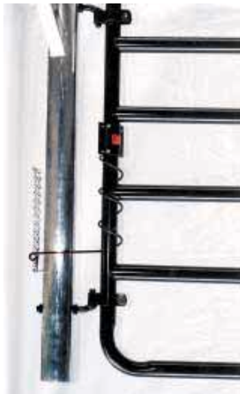
"Gate Shut" consists of a single spiral spring that slips onto hinged side of a gate. A catch arm at top of spring rests against gate post.

Contact: FARM SHOW Followup, Lyle Abernathy, Box 197, Yacolt, Wash. 98675 (ph toll-free 866 868-3267 or 360 686-8141; fax 360 686-8203; E-mail: gateshut@pacifier.com).