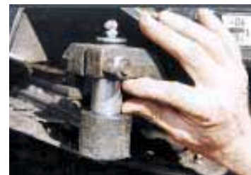
Pitman drive was extended downward 1 1/4 in. using a short section of steel cut out of a hydraulic cylinder.

Lowering the knife mounting also meant that the shaft that attaches the pitman arm to the knife was 1 1/4 in. too short. Siemens says the machine shop solved this problem by making a new, longer shaft out of a piece from a hydraulic cylinder. "The diameter of the hydraulic cylinder shaft was the same as the one we were replacing, so all they did was cut it the right length, drill through the center, and install a grease zerk so we could grease the needle bearing in the knife head,"