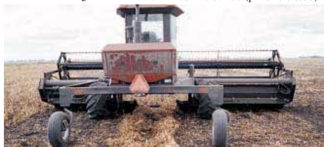
"We can run the knife in the dirt if we need to when cutting beans," says Siemens.

Contact: FARM SHOW Followup, Jack Siemens, Box 42, Plum Coulee, Manitoba R0G 1R0 Canada (ph 204 829 3995).