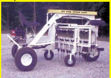
The self-propelled rake is powered by an 8 hp air-cooled gas engine and has a pair of gauge wheels. Cranks are used to regulate ground clearance. A horizontal tree protector wheel on the right side of