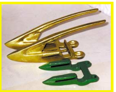
they needed no further testing to know that the Liftguards were what they needed, and they hoped I could sell them to them. A dealer who wrote assumed the Liftguards were already in production and asked me to supply his several retail outlets.

Response to your article on our Liftguard (TM) combination rock guards and crop lifters far exceeded what I had imagined. While the article clearly stated that I had only tested them in my wild rice crop and was looking for a manufacturer, most callers, many of whom spoke in terms of sections of land rather than acres, said