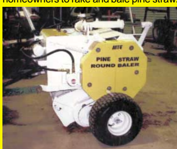
The machines include a self-propelled, hydraulic-driven, 52-in. wide rake, and a 3-pt. mounted, pto-driven round baler. The baler makes bales that measure 15 in. in diameter and 24 in. long. The bales weigh 18 to 24 lbs. so they're easy to handle. An audible signal on the baler tells you when the chamber is full.

Our new pine straw harvesting machines, introduced at the recent Sunbelt Expo near Moultrie, Ga., allow farmers and homeowners to rake and bale pine straw.