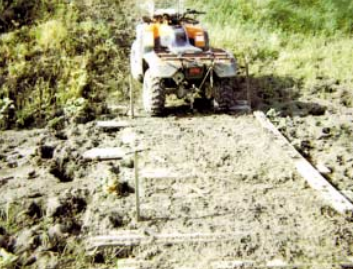
getting stuck so I made a heavy wood frame out of 2-in. planks. It lays flat on the mud so it can stand a lot of weight. I drove a steel post in at each corner and ran a light chain from the platform to each post to keep it from floating away when the water runs 3 to 4 ft. deep.

I have a muddy creek that runs through my pasture during wet seasons. I needed a way to allow cattle to cross without