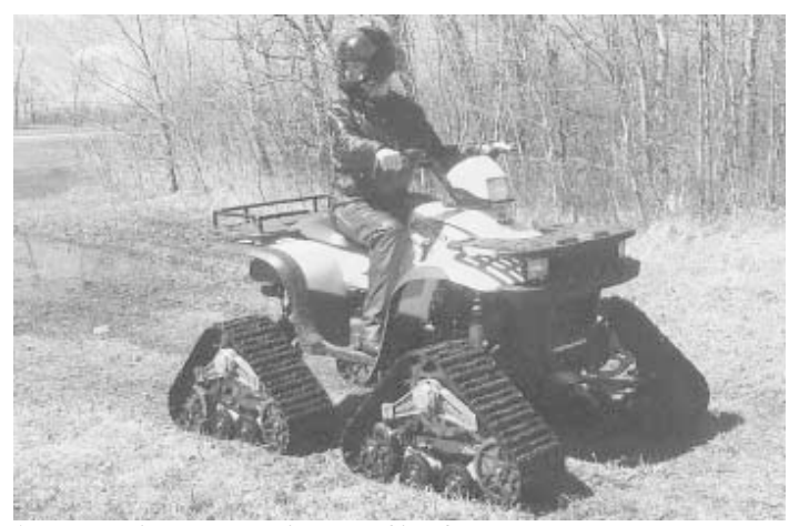
ATV conversion tracks provide about 4 in. of extra clearance, yet actually lower the center of gravity, making your ATV more stable.

All prices include shipping. Add $.50 per issue in Canada. Contact: FARM SHOW Back Issues, P.O. Box 1029, Lakeville, Minn. 55044 ph toll-free 800-834-9665 or 952 469-5572 M-F, 7:30 to 4:30 M-F CST)