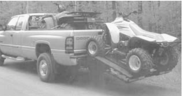
Rear-mounted ramp system fits into pickup receiver hitch. No need to remove tailgate.

Contact: FARM SHOW Followup, Wisconsin Metal Fab, 1875 Olson drive, Box 27, Chippewa Falls, Wis. 54729 (ph 715 720-1794; fax 715 720-1797; Website: www.wisconsinmetalfab.com).