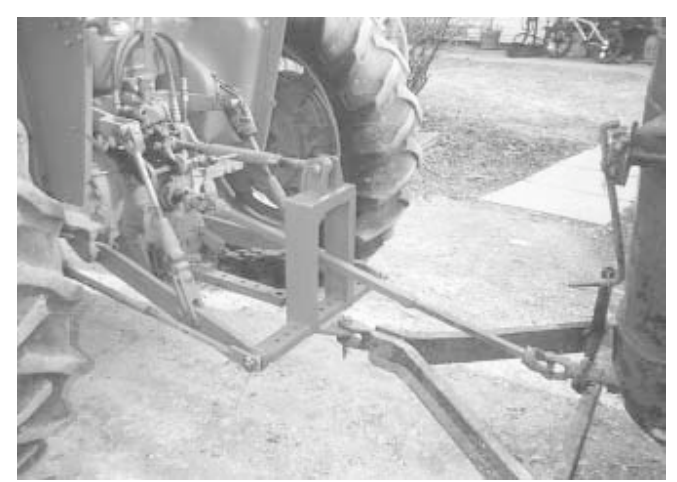
Seltzer welded an open steel frame onto his tractor drawbar. Top of frame hooks to the 3-pt. top link, which makes the drawbar rigid. A pto shaft can run through frame.