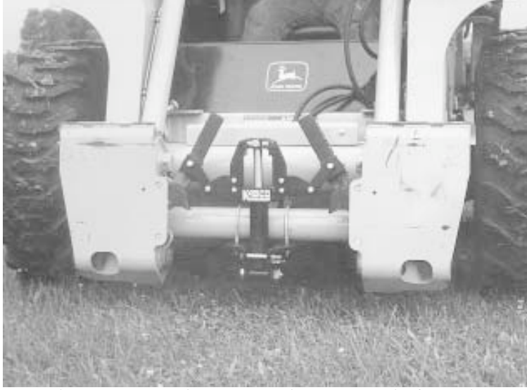
Hydra-Hitch uses a small cylinder to hydraulically move a pair of latch pins up or down, virtually eliminating the need to ever get out of the cab, says the company.

Contact: FARM SHOW Followup, Leonard Seltzer, 16040 W. Elmwood, Manhattan, Ill. 60442 (ph 815 478-3578).