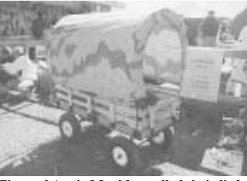
Tim and Angie Moulder pulled their little boys in this home-built covered wagon.

keep the wagon from moving whenever it's parked on slopes.