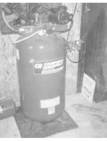
Seubert installed this 80-gal. air compressor in his shop.

"The poly tubing is easier to install than either PVC pipe or steel lines because it doesn't require elbows to go around corners. It's also easier to expand - all I have to do is splice into it with a T bracket. It doesn't collect as much moisture as steel lines and costs about the same. The tubing can withstand up to 2,500 psi.