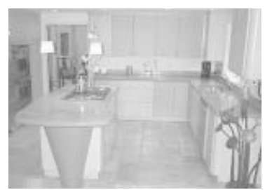
Using special formulations and colorings, concrete fabricators can make countertops in any number of kitchen or bathroom colors

If you were doing it yourself, you'd probably pour a concrete countertop in place, but the experts say making countertops is not a trick you should try at home. Rather, it should be done in a fabricating shop where lines and edges can be formed more precisely and it can be cured and sealed under controlled conditions.