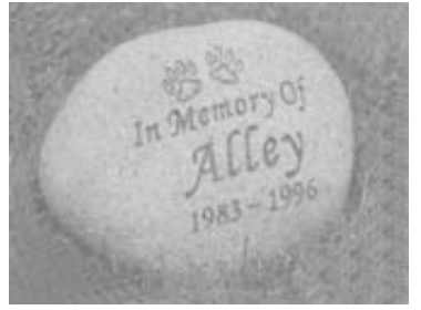
Images and words can be engraved onto stones that can be used as memorials to your pet.

Contact: FARM SHOW Followup, Hold That Thought, 1410 Monument Blvd., 102-