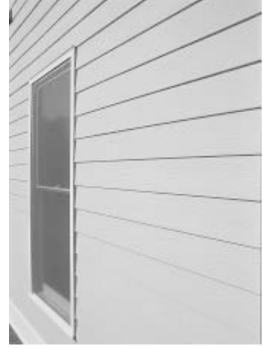
Fiber cement siding offers longevity and low maintenance with a natural look, says the company.

It has little or no insulation value, so keep that in mind when insulating and wrapping the house before the siding is installed.