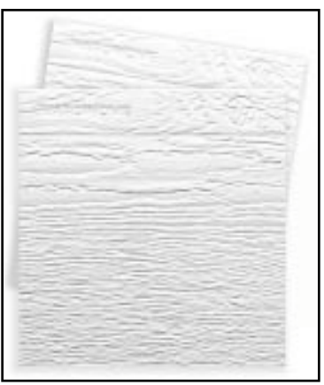
The siding replicates the warmth and beauty of natural rustic cedar wood.

Contact: FARM SHOW Followup, Cemplank, Inc., Excelsior Industrial Park, P.O. Box 99, Blandon, Pa. 19510-0099 (ph 877 CEMPLANK; Website: http://www.cemplank.com/cemplank.html); or CertainTeed Corporation, WeatherBoards FiberCement Siding, P.O. Box 860, 750 East Swedesford Road, Valley Forge, Pa. 19482 (ph 877 295-0970); or James Hardie Building Products, 26300 La Alameda, Suite 250, Mission Viejo, Calif. 92691 (ph 877 6HARDIE or 888-JHARDIE; Website: www.hardihome.com).