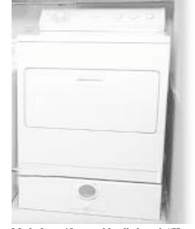
Made from 18-ga. cold rolled steel, "Heat Helper" installs under your dryer.

Contact: FARM SHOW Followup, Heater Helper, Wichita, Kan. (ph 800 852-9775 or