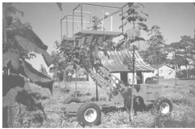
Thompson figured there probably wasn't a more stable machine than an Air Force bomb loader so he bought one and converted it into a pruning platform.

Contact: FARM SHOW Followup, Randy Thompson, 8794 Denham Road, Sycamore, Ga. 31790 (ph 229 831-4795; E-mail: dianet@surfsouth.com).