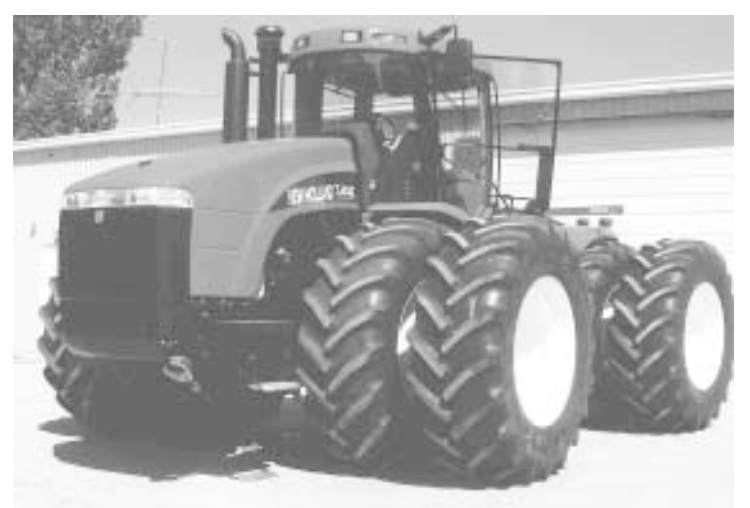
When tested at the Nebraska Tractor Test Lab, New Holland's latest 4-WD's set records for highest drawbar pull, 3-pt. hitch capacity, and highest maximum pto power, according to the company.

"Milestone," he says. "These tractors are the right product at the right time. New Holland is fully prepared to provide the support to all its dealers and customers to