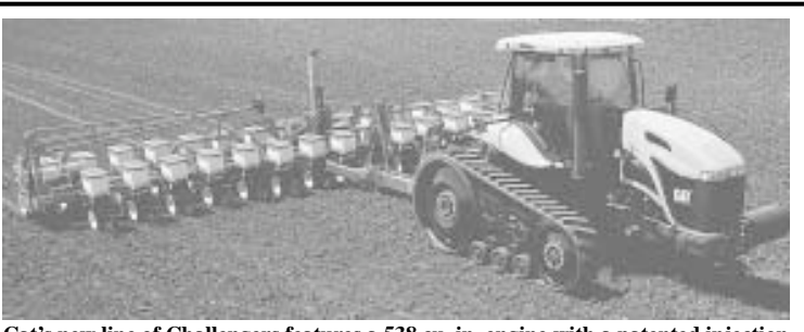
Cat's new line of Challengers features a 538\,\mathrm{cu} . in. engine with a patented injection system that automatically adjusts to changes in load.

You can read more about the new tractors at www.cat-ag.com.