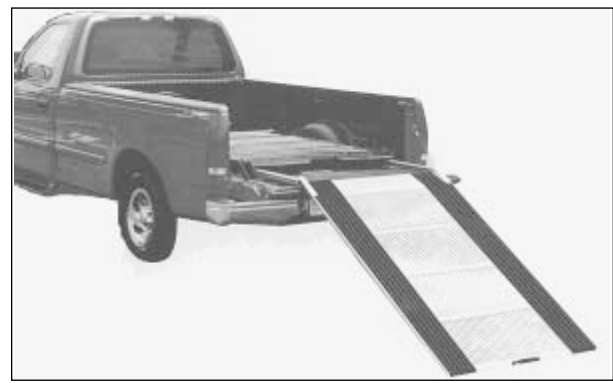
Load Pro covers existing pickup bed with a false floor. Loading platform and telescoping extensions store beneath the cargo deck.