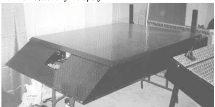
Toolbox is made from either chrome or diamond plate steel. You can drive ATV right on top of toolbox.

Contact: FARM SHOW Followup, ETEC, 2310 Hanselman Ave., Saskatoon, Sask., Canada S7L5Z3 (ph 800 434-5309; Website: www.loadpro.ca).