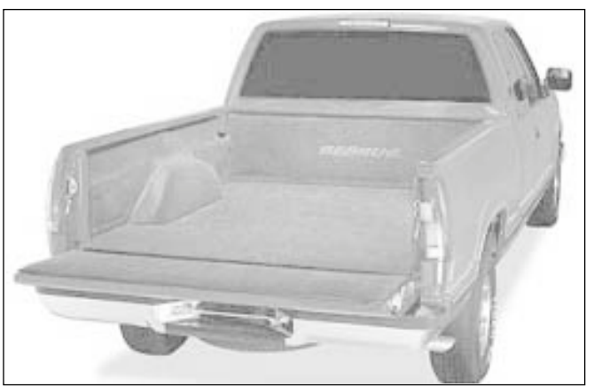
One-piece, custom molded mat is designed to cover pickup's floor and side walls.

Contact: FARM SHOW Followup, Rapid Ramp, Box 217, Harvard, Neb. 68944 (ph 402 772-3501).