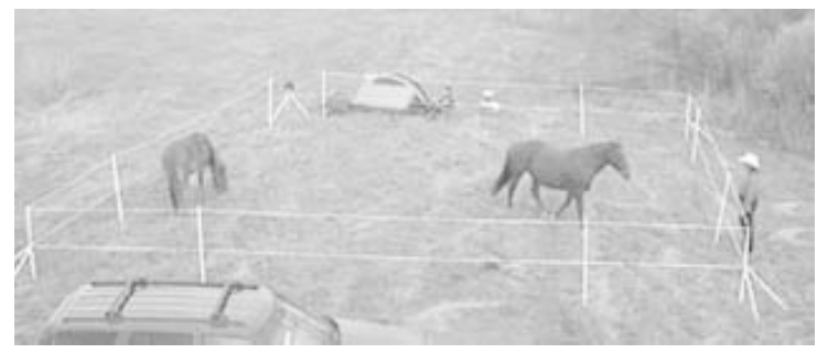
Enclosure holds horses in, but gives way if they're spooked without causing injury.

"These posts are so easy to set up that my assistant's five year old son can move the cross fence in our horse pasture," says Pulliam. "Yet when set in good conditions, I