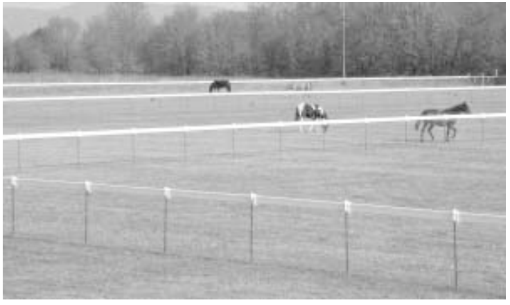
"Equi-Tee" fence system changes ordinary wire mesh fence into an attractive enclosure with a visual barrier that reduces the chance for injuries to horses.

Contact: FARM SHOW Followup, Joseph Berto, Equi-Tee Farm and Fence, 6539 Rogue River Drive, Shady Cove, Ore, 97539; (ph 541 878-4112, 888 253-6245, E-mail: information@fencingsolutions.com; Web site: www.fencingsolutions.com).