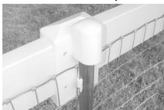
PVC plastic "clip-top" adapter fits on top of steel T posts and supports vinyl top rail.