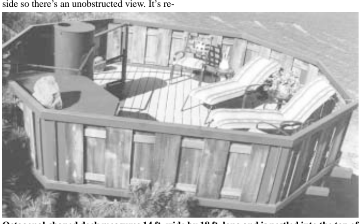
Octagonal-shaped deck measures 14 ft. wide by 18 ft. long and is nestled into the top of an evergreen tree. Note LP gas fireplace.