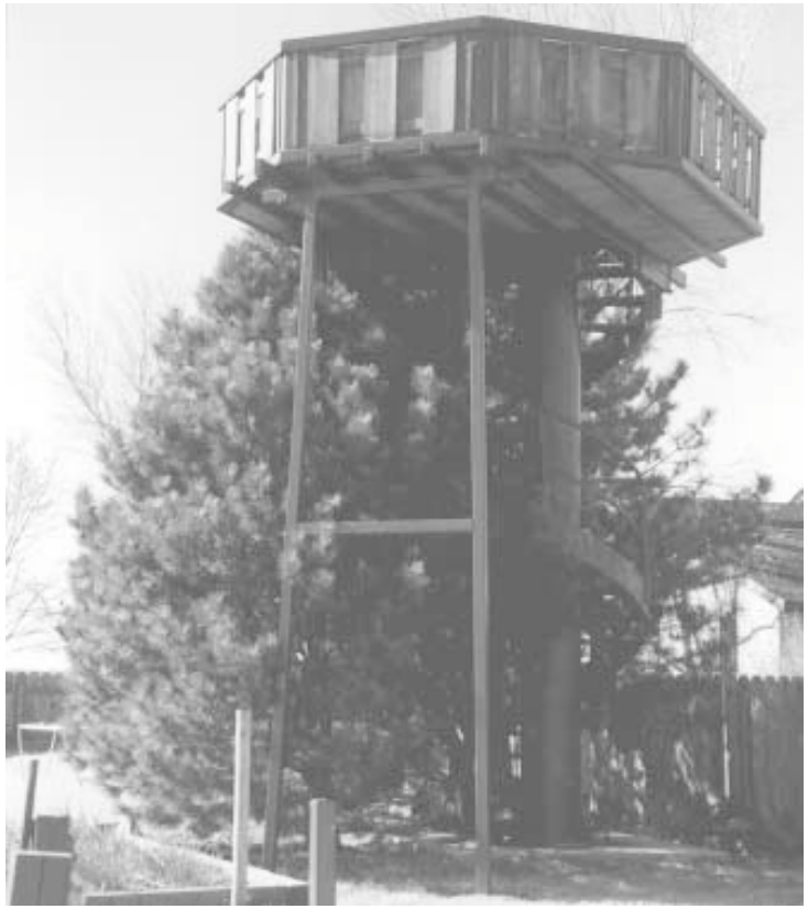
Deck perches 20 ft. above ground, with a 72-in. dia. spiral staircase leading up to it from below. Support is provided by a 24-in. dia. steel pipe and a pair of steel legs.