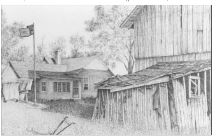
Doornbos likes to do pencil drawings of agricultural scenes such as this old farmstead

Contact: FARM SHOW Followup, Robert Doornbos, 6485 72nd Ave., Hudsonville, MI 49426 (ph 616 875-7418).