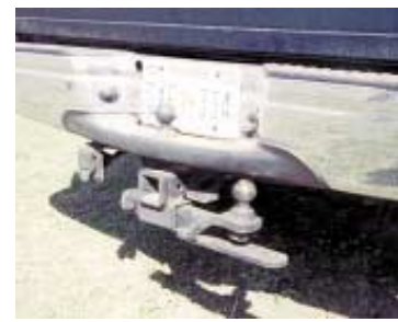
Hitches are carried out of the way, underneath the back edge of bumper.