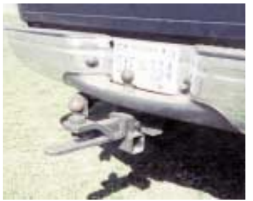
Hitch assembly consists of ball hitch and straight drawbar. Note small ball on bumper.

Contact: FARM SHOW Followup, Kari Warberg, Crane Creek Gardens, 4551 78 Ave. NW, New Town, N. Dak. 58763 (ph 800 583-2921; Website: www.earth-kind.com).