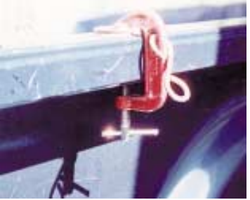
Tie-down bracket is made by brazing a flat washer to "fixed" end of clamp, then drilling a hole in clamp and inserting an S-hook that's closed into a loop.