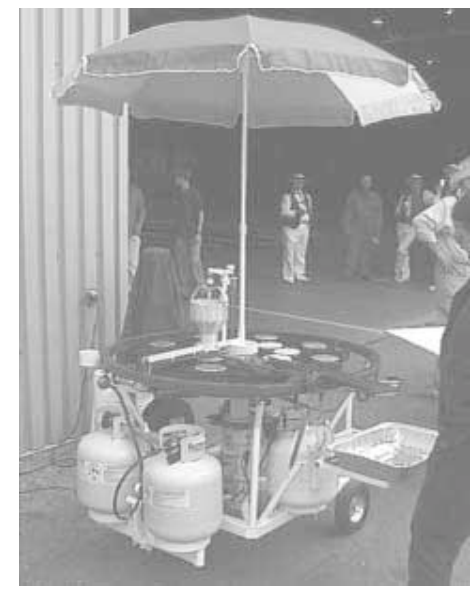
Batter is measured and dropped automatically onto a large round griddle which is rotated slowly by a 120-volt AC motor. An umbrella provides shade for the operator.