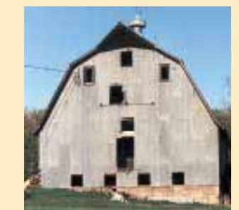
The McKinnon's turned this dilapidated gambrel-roofed barn into a beautiful modern home.

the property until we were ready to move into the barn. The person we hired to put on the new roof discovered during the project that it was his grandfather who had actually built the barn. Once he found that out he wanted to do a lot more, such as the major interior