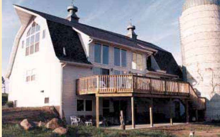
House has a big window on one end, an asphalt roof with two big cupolas on top of it, and a walk-out deck on both sides. The silo that stood next to the barn is still there.

Contact: FARM SHOW Followup, Bob McKinnon, Rt. 2, Box 160, Dent, Minn.