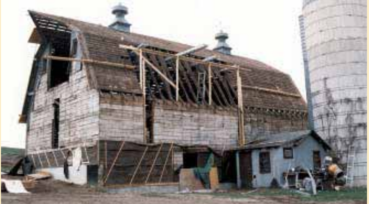
This photo was taken after the original cedar roof and galvanized tin siding had been removed.