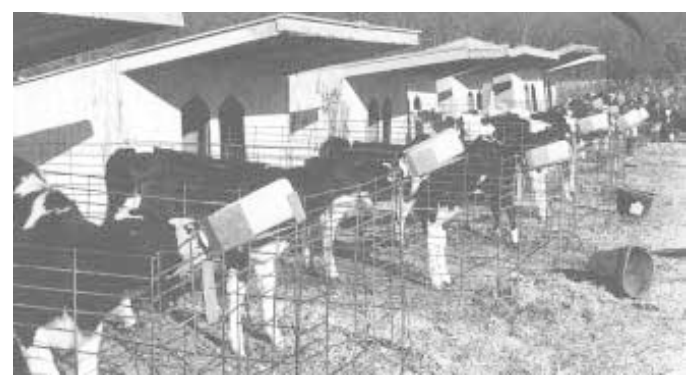
Calf "bottle holder" is designed to hold 2-qt. milk bottles.