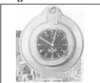
Recorder helps with preventative maintenance by telling you how many hours the engine has actually been working as opposed to idling.

Two different models are available - one with a recording period of 24 hours and the