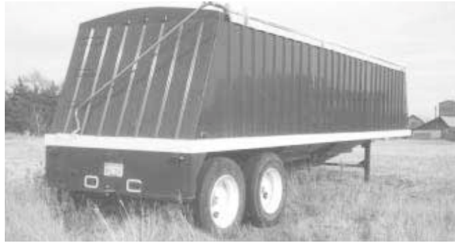
Trailer mounts on axles from an old oil tanker trailer, which Reinhardt rebuilt. He uses a semi tractor to pull the unit.