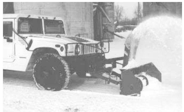
He also uses a Hummer to operate a snowblower, and to drive to town.