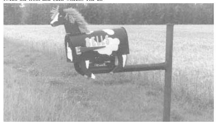
Unusual mailbox looks like a "Paint" horse and is complete with rope mane and tail.

Contact: FARM SHOW Followup, Sten Nielsen, 53452 Rg. Rd. 225, Sherwood Park, Alberta, Canada T8A 4V3 ph and fax 780