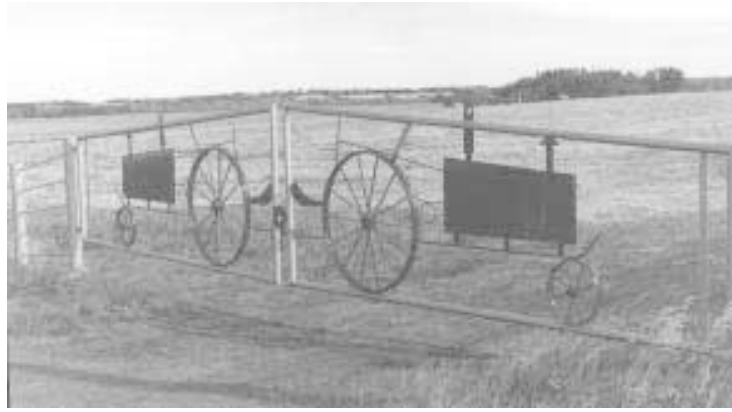
Artistic 36-ft. gate displays two identical tractors, pointed in opposite directions.