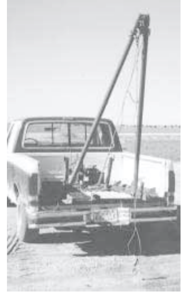
Winch attaches to pickup's gooseneck hitch and consists of a steel frame that supports a pair of gin poles.

Lamb says he's looking for a manufacturer. Contact: FARM SHOW Followup, George