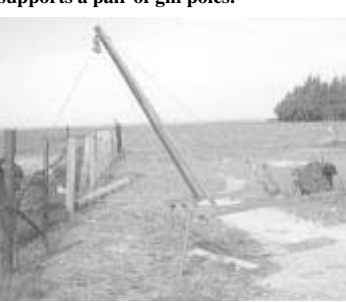
When not in use, Lamb stores winch by hooking it to fence post so it's standing up, ready to slide into pickup bed.

Lamb, Box 340, Gruver, Texas 79040 (ph 806 733-2893)