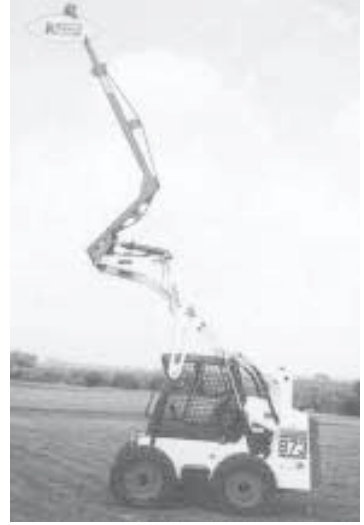
Crane is built in three sections. Lift capacity ranges from 1,500 lbs. when retracted, to 500 lbs. at full extension.

Mfg. Co., Inc., 170 W. 600 N., Shelbyville, Ind. 46176 (ph 317 398-7973).