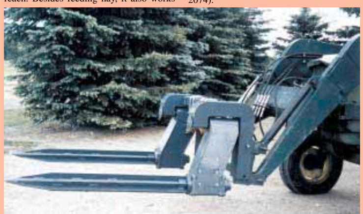
Hydraulic-driven tines have welded-on traction bars that grab bale as it's being unrolled. Operator hydraulically moves tines closer together as bale gets smaller.

Contact: FARM SHOW Followup, Fab Tec Mfg. Ltd., Box 219, Spy Hill, Sask., Canada S0A 3W0 (ph 306 534-2213; fax 2074)