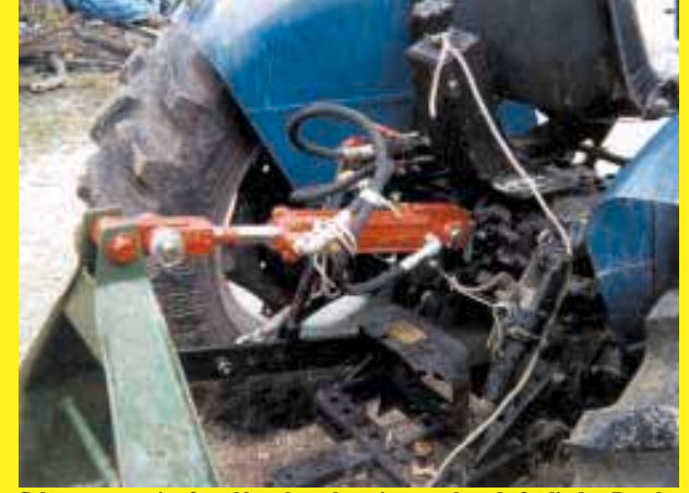
Seltzer cut a pair of steel brackets that pin to each end of cylinder. Brack-ets in turn pin onto tractor and 3-pt. hitch.