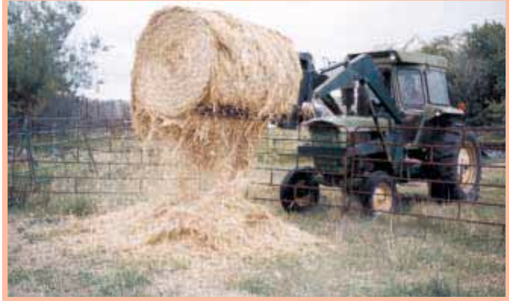
Bale fork works great for unrolling straw into small pens.

"I generally wait until there are several broken teeth on a wheel before I replace all of them. It wouldn't work to replace individual ones because my teeth are shorter than the original ones. The tooth is designed to be inserted into the band and bolted to the hub the same way as the original teeth. However, only one bolt is needed per tooth instead of two which makes them easier to install. Also, I don't have to change the hub or the outside band. It takes 20 sets of teeth per wheel. Each set of teeth sells for $1.35. "Another advantage is that the same size