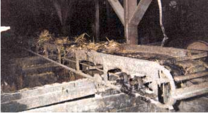
Manure conveyor - a converted 40-ft. bale elevator - lies across top of farrowing pens inside an old hip roofed barn.