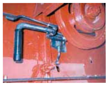
Steel brackets bolt to each side of combine and come with linkage that attaches to rear bolt of tray.

"If you don't raise the tray for soybeans you can end up doing a lousy job chopping straw. If you don't lower the tray for corn, cobs and other material can bounce back