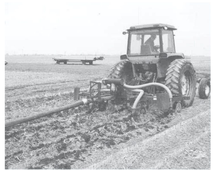
Tractor-mounted, 4-row injector is fed by a 660-ft. long, 4-in. dia. rubber drag hose that in turn hooks up to aluminum irrigation pipe.