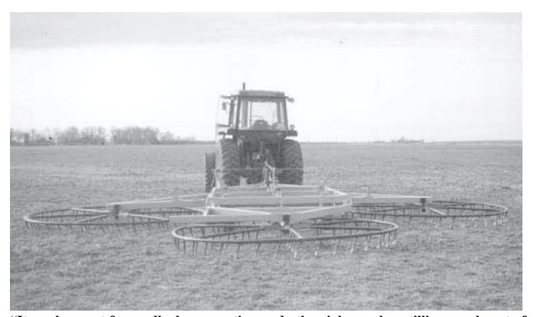
"It works great for seedbed preparation and other jobs, such as tilling weeds out of recently seeded alfalfa," says Douglas.

Contact: FARM SHOW Followup, Douglas Welding & Machine, Inc., 116 W. Main, Kipp, Kan. 67401 (ph 785 536-4902).