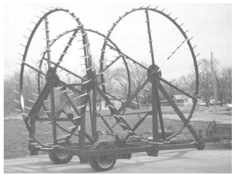
Rotary harrow has three non-powered rotating wheels, two in front and one in back. All three wheels fold up for transport.