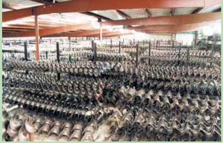
Auger flighting is not in short supply at Replacement Flighting Supply's warehouse in Aurora, Neb.

Contact: FARM SHOW Followup, Reliable Equipment, Rt. 2, Petersburg, Ontario, Canada NOB 2H0 (ph 519 634-5480).