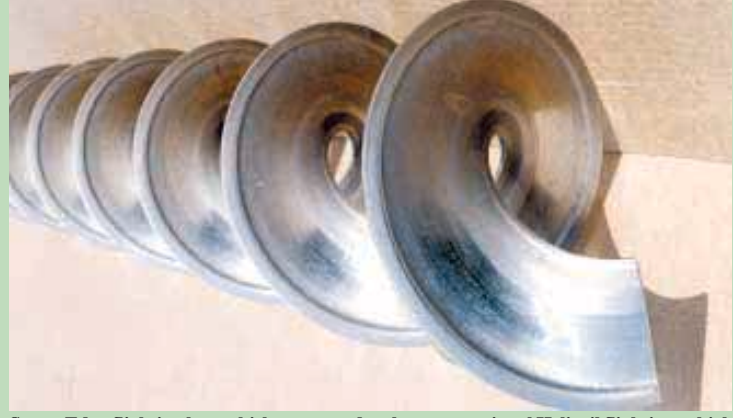
Super-Edge flighting has a thicker outer edge than conventional Helicoil flighting, which results in longer wear.

reinforce it if only a small portion of the flighting is in need of repair