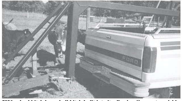
Fifth wheel hitch has a ball hitch built into it, allowing Cooper to quickly switch from one trailer to another.

Contact: Mark Fair, 956 Butter Rd. West, Rt. 2, Ancaster, Ontario, Canada L9G 3L1 (ph 905 648-3364).