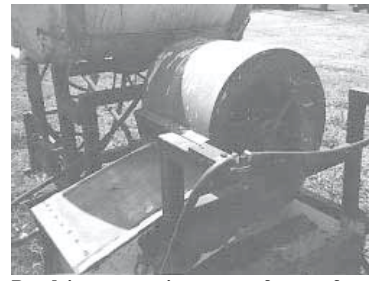
Pto-driven crop mister uses a furnace fan to apply foliar fertilizer to soybeans. Blower can be rotated up to 200 degrees in either direction using a hydraulic cylinder.

To rotate the blower back and forth, he mounted a sprocket on the front side of the blower housing and mounted a hydraulic cylinder on one side of the steel frame. He mounted a smaller sprocket on a piece of angle iron that's hooked up to one end of the