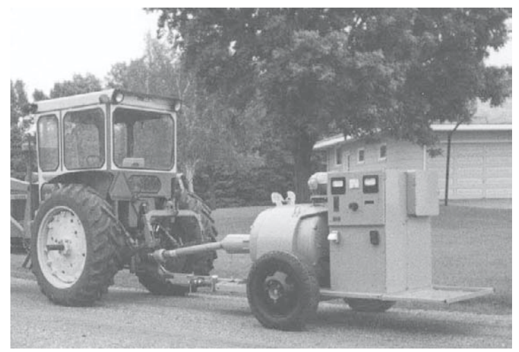
Ellsworth Olson and Meredith Ulstad converted a 100 hp, 3-phase synchronous electric motor into a pto-powered backup generator.