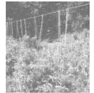
Wire is strung across top of plants, which climb up loops of suspended twine.

Contact: FARM SHOW Followup, Joe Lynch, Rt. 6, Box 26, Ames, Iowa 50010 (ph 515 292-0117).