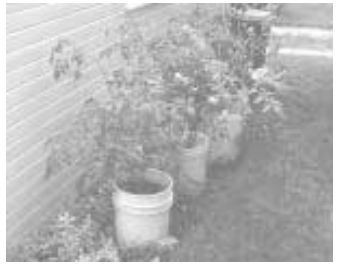
A 5-gal. bucket filled with dirt makes a handy tomato planter, says Stone.

Contact: FARM SHOW Followup, Jimmie Stone, 725 F. Ave., Nevada, Iowa 50102 (ph 515 382-2914).