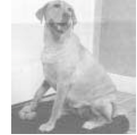
Dog activates chime by putting his paw on pad.

Contact: FARM SHOW Followup, Lentek, P.O. Box 560445, Orlando, Fla. 32856 (ph 407 857-8768).