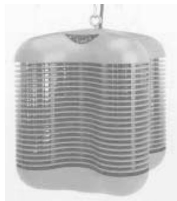
Unit is equipped with four "wings" which contain electro-static panels.

The unit should be placed at least 30 ft.