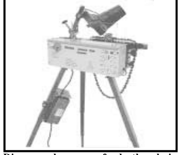
Dinasaw sharpener feeds the chain through and "looks" for the teeth, automatically adjusting to whatever angle

Dinasaw Pty. Ltd. holds patents for the chainsaw sharpener in the U.S., Germany, UK and Australia. It is not yet handled by a distributor in the U.S., but negotiations are