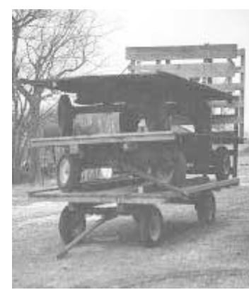
Hay racks stack three high for winter storage.

White, 2039 Campus Rd., South Euclid, Ohio 44121.