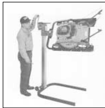
Free-standing Heftee 250 (above left) can handle push mowers, chain saws, and small engines, and can be fitted with a flat platform for standup work on small equipment. The Heftee 2000 (above right) lifts 2000 lbs. up to 6 ft. high.

Contact: FARM SHOW Followup, Stanley Works, 1000 Stanley Dr., New Britain, CT 06053.