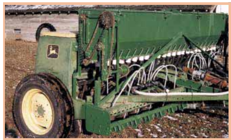
Miller modified his Deere 8200 drill by mounting a fertilizer box on front and adding knives that band liquid urea 3 in. to the side of the furrow and 2 in. below the seed.