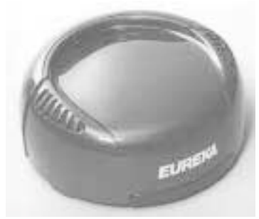
"Robot" runs for about an hour and a half before needing recharging.

Eureka Company, 1201 E. Bell Street, Bloomington, Ill. 61701-6902 (ph 309 828-2376)