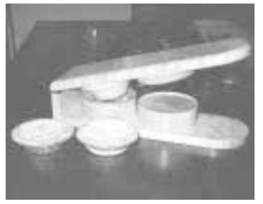
Press is available in three sizes, including this 5-in. model for pot pies.

"Our standard 3-in. Tart Press uses 3-in. foil tins and is our most requested unit. We also have a 1 3/4-in. press that uses a mini muffin pan to press out small shells for hors d'oeuvres. Our Sandbakkles press uses individual reusable metal tins. These tins have a fluted edge and can be used for Scandinavian cookies or to make 2-in. pastry shells. Our biggest press is a Small Pie Press that can be used to make 5-in. meat pies or, if