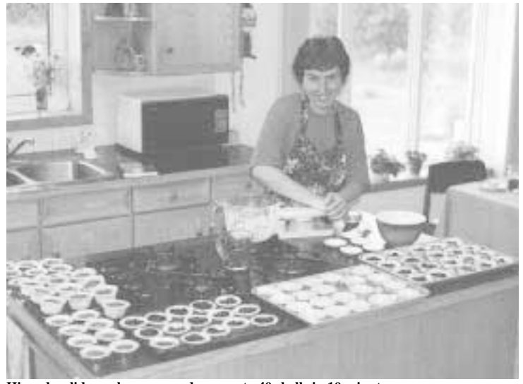
Hinged, solid-maple press produces up to 40 shells in 10 minutes.