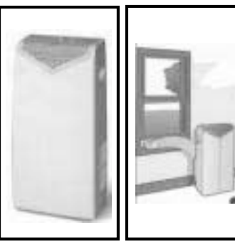
Unit mounts on wheels to make moving it easy.

Contact: FARM SHOW Followup, Fedders, 415 West Wabasha Ave., Effingham, Ill. 62401 (ph 217 342-3901).