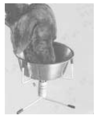
Design confuses ants so they won't crawl past the "collar" on the legs.

Contact: FARM SHOW Followup, Gold Canyon Pet Products, 511 West Guadalupe, Suite 23, Gilbert, Ariz. 85233 (ph 800 390-3010 or 602 539-8487; fax 8508; Website: www.goldcanyonpet.com