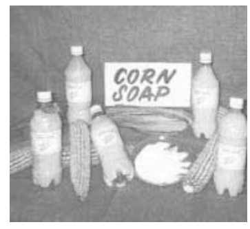
"Industrial strength" soap is about 60 percent corn, mixed with borax, lanolin and other ingredients.

Contact: FARM SHOW Followup, Richard Layden, 11443 East 4200 North, Hoopeston, Ill. 60942 (ph 217 283-6864).