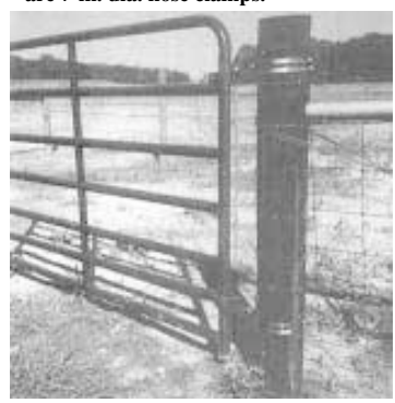
Design eliminates the need to drill holes into the post.