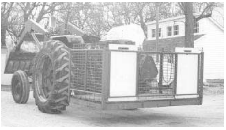
\label{eq:Apair} \textbf{A pair of sliding wooden doors on each side of the trailer are raised to let hogs in or out.}