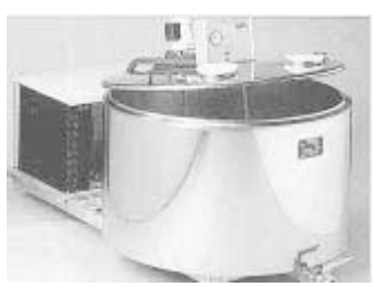
Cooling tank capacities start at 110-

Contact: FARM SHOW Followup, Bob Turner, P.O. Box 4595, Gettysburg, Pa. 17305 (ph 717 338-0671; Email: turner@mail.cvn.net). You can also visit Pladot's website at: www.pladot.co.il.