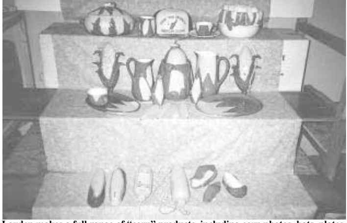
Layden makes a full range of "corn" products, including corn photos, hats, plates, pens, mailboxes, etc.

Contact: FARM SHOW Followup, Richard Layden, 11443 East 4200 North, Hoopeston, Ill. 60942 (ph 217 283-6864).