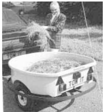
Two-wheeled trailer has a round metal band that goes completely around poly tub.