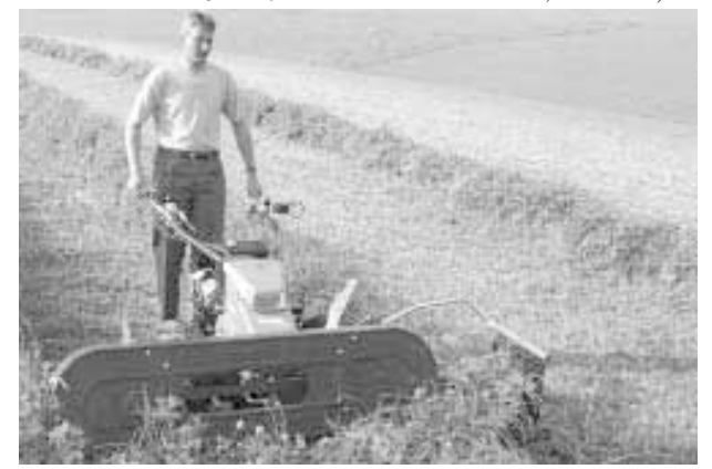
Two-wheeled, hydrostatic unit is equipped with front-mount pto, allowing it to be used with a variety of implements. Driver walks behind and holds onto handlebars.

Contact: FARM SHOW Followup, Small-holder Tractor Company Ltd., Unit 1, Badsey Field Lane, Badsey, Evesham, Worcestershire, England WR11 5EX (ph 0044 01386 834442; fax 834399).