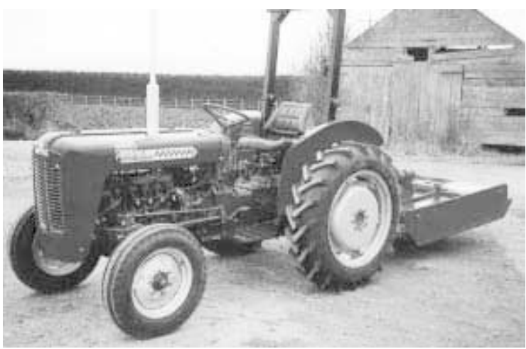
"Smallholder" tractors range from 30 to 55 hp and are based on Massey Ferguson 35 castings. They contain a mix of new and remanufactured parts that keeps cost down.