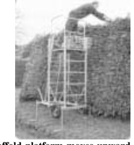
Scaffold platform moves upward at 1-ft. intervals to a maximum height of 7 ft.

Contact: FARM SHOW Followup, Haygate Engineering Co. Ltd. Manor Farm, Hannington, Tadley, Hampshire RG26 5TZ (ph 01635 299847; fax 299024).