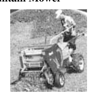
Unit can be used to power a mini round baler.

Contact: FARM SHOW Followup, Rekord Sales (G.B.) Ltd., Manor Road, Mancetter, Atherstone, Warwickshire CV9 1RJ (ph 01827 712424; fax 715133).