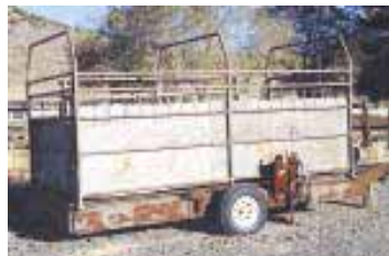
Hydraulic hand pump powers 2 hydraulic cylinders that raise and lower scale.

"It's now very stable. The scale is only 13