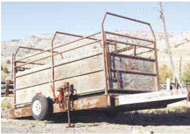
Electronic scale is fitted with a retractable axle, cattle rack, tongue, and gear jacks.