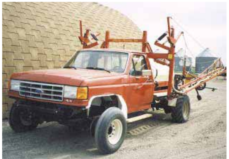
Rivard extended the pickup axles to 88 in. and mounted single rib tires on front and lugged tires on back. He also mounted a 300-gal. tank and 66-ft. boom on back.

Contact: FARM SHOW Followup, Victor Larson, 1163 W. Townline Rd., Freesoil, Mich. 49411 (ph 231 464-5619)