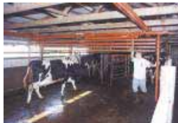
Gate is raised and lowered by a pair of cables that ride freely up or down steel pipes at outside ends of gate.

The gate is raised and lowered by a pair of cables that ride freely up or down a pair of steel pipes at the outside ends of the gate. The cables are controlled by a 5-ft. long, 2-10 • FARM SHOW • web site: www.farmshow.com • e-mail: Editor@farmshow.com • phone 1-800-834-9665