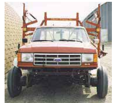
Pickup axles are wide enough to straddle four 22-in. rows. Widening the axles keeps the number of tracks made across the field to a minimum, says Rivard.

To widen out the axles, Rivard made four