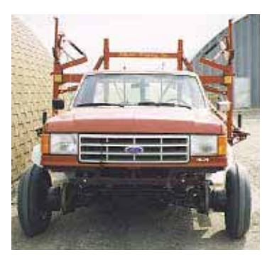
Pickup axles are wide enough to straddle four 22-in. rows. Widening the axles keeps the number of tracks made across the field to a minimum, says Rivard.

To widen out the axles, Rivard made four