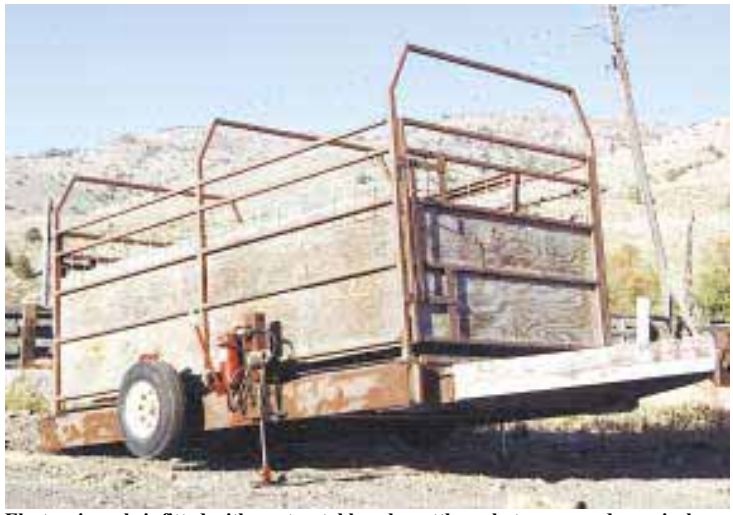
Electronic scale is fitted with a retractable axle, cattle rack, tongue, and gear jacks.