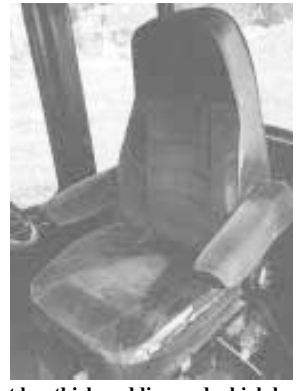
Seat has thick padding and a high back. ever, aftermarket ones sell for up to $500 apiece. My only cost was $100 for the seat and $20 for the pump."

"I don't think there's a more comfortable tractor seat anywhere," says McGregor. "The original seat never was very comfortable. My dad uses the tractor a lot to pull a field cultivator. Some of the newer tractors come factory equipped with air ride seats. How-