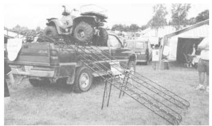
Ramp system consists of four separate steel arches that mount in pickup bed. Side ramps run from ground up to pickup.

Contact: FARM SHOW Followup, Walter Fifelski, 1700 138<sup>th</sup> Ave, Rt 2, Wayland, Mich. 49348.