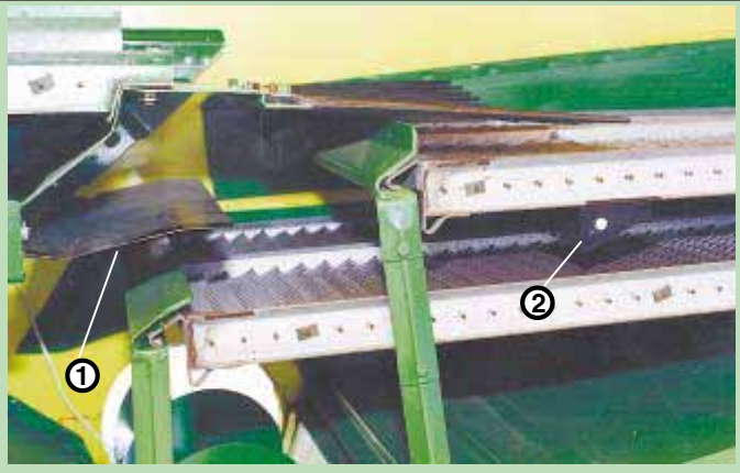
Deflector (1) directs air to "scoop" (2) under top chaffer.

V-shaped unit that also has slanted bars spaced 16 in. apart. The two sets of slanted bars are offset. The floor slants down toward the sides, forming a 12-in. wide trough at the bottom on each side. Any feed that drops out of the cow's mouth falls into the trough. Both ends of the feeder, as well as the sides at the bottom, are enclosed with 3/16-in. sheet metal. If we want we can use a forklift or frontend loader to pick up the unit and move it to another pen. (Joel Waldner, 67 Tudor Crescent, Lethbridge, Alberta, Canada T1K 5C7)