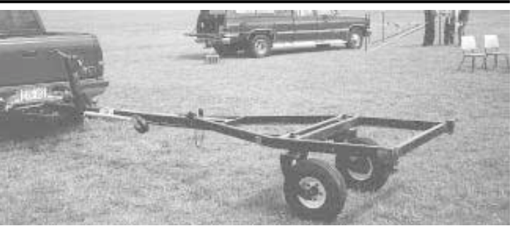
Easy-backing 15-ft. trailer is equipped with a pair of 8-in. caster wheels on back.

Contact: FARM SHOW Followup, Dick Thompson, 2035 190th St., Boone, Iowa 50036 (ph 515 432-1560).