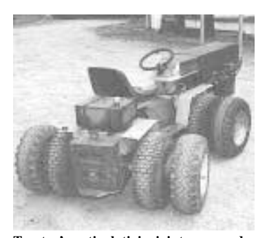
Tractor's articulation joint was made using ball joints off a tractor 3-pt. hitch.

A hydraulic pump off an old lawnmower mounts underneath the seat behind the front hydrostatic transmission. It's joined with the