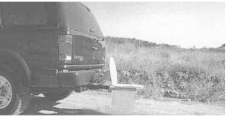
Toilet seat can be fitted with plastic bag for easy cleanup.