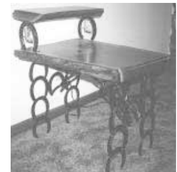
End table is made from a thick slab of walnut held up by 22 horseshoes.

Contact: FARM SHOW Followup, Eric Pekarek, Rt. 1, Box 193A, Valparaiso, Neb. 68056 (ph 402 784-3793).