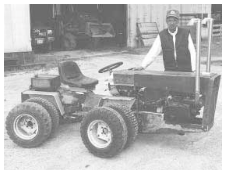
Tractor is powered by a 2-cyl. 18 hp Onan engine and has two Cub Cadet hydrostatic rear ends.