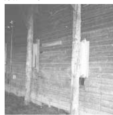
Five poles were set along the outside wall. Threaded redi rod was used to draw the walls to the poles.

He also set poles in the ground along each