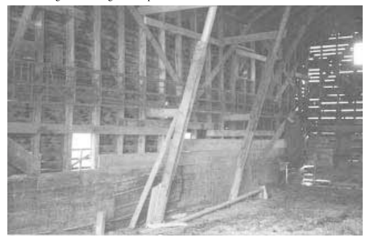
Poles were set in the ground inside to brace walls and roof.

Contact: FARM SHOW Followup, Turbes Enterprises, R.R. 1, Box 255, Lamberton, Minn. 56152 (ph 507 752-7713).