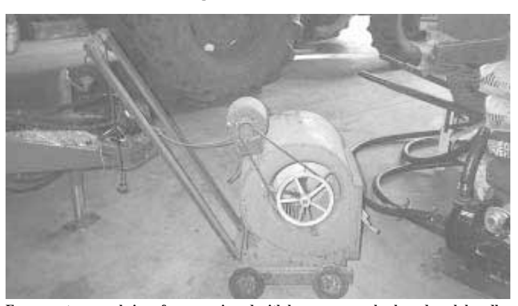
Fan mounts on angle iron frame equipped with lawn mower wheels and push handle.

& Co. Pty Ltd., 27 Princess Highway, Warragul, Victoria 3820 Australia (fax 03 5623 4483).