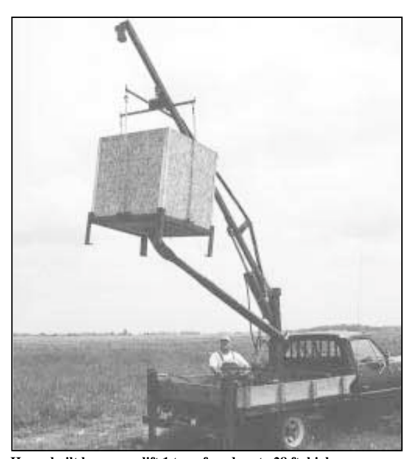
Home-built boom can lift 1 ton of seed up to 28 ft. high.