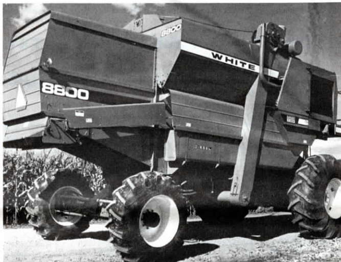
Mud-Hog Power Package contains all the necessary parts for converting 2-wheel drive tractors, combines and cotton pickers to 4-wheel drive.