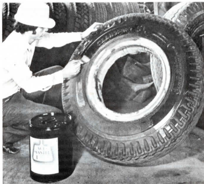
Age-Master #1 is easily painted on tread grooves and sidewalls to extend tire life and improve performance. The manufacturer recommends treating all farm tires, whether in use or standing idle.

For more details, contact: FARM SHOW Followup, Chem-Pro Mfg., Box 213, Buffalo, N.Y. 14221 (ph. 716 741-2079).