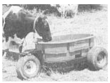
Wagon's 18-in. high rubber tank sits 4 to 6 in. off the ground, making itlow enough to slip under most electric fence lines.

"The rubber tank is 18 in. high and sits