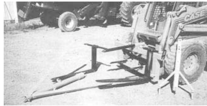
Bale spear, pallet forks, 5-ft. boom and drawbar can be used with the skid steer loader

Contact: FARM SHOW Followup, Tim Louwagie, 2956 County Rd. 22, Cottonwood, Minn. 56229 (ph 507 423-6674).