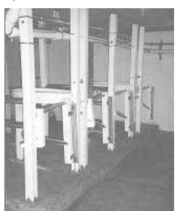
White 4-in. sq. plastic posts form the corners of Lisowe's milking parlor stalls.

"I set up this parlor four years ago and have used it to milk 30 cows twice a day, which