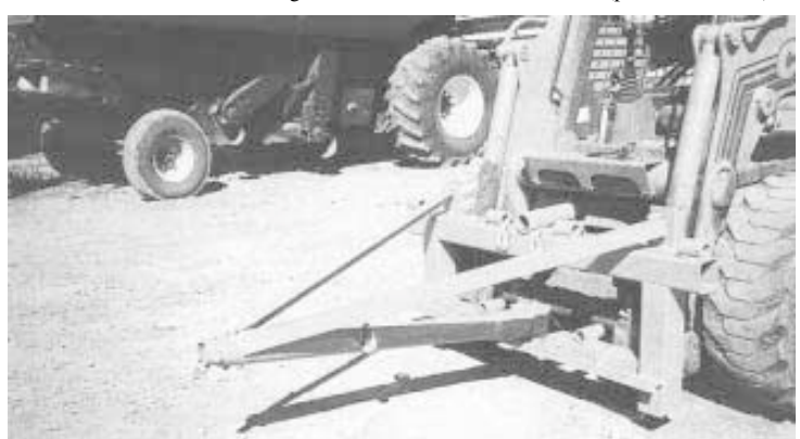
Tool consists of a quick-tach frame that can be fitted with several accessories.

Contact: FARM SHOW Followup, Gary Lisowe, 5461 Klatt Rd., Gillett, Wis. 54124 (ph 920 855-6127).